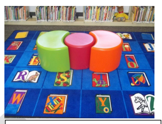
New rug and chairs purchased for the Children's area in the Yale Valley