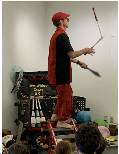
Feb. 2016), and adult patrons expressed pleasure to have someone new and not "just